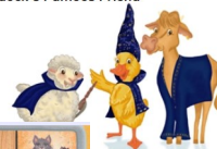
Digiduck and the Magic Castle