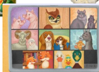
Digiduck Saves the Day