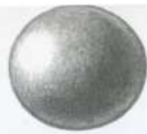
blending: gradually changing the value