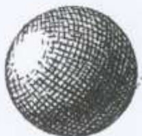
cross-hatching: lines that cross one another