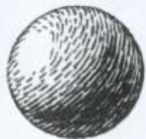
hatching: thin parallel lines